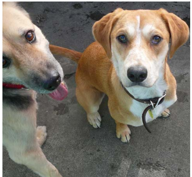
Humphrey & Hazel

Humphrey has been boarding with us since the beginning and in his advanced age, was starting to slow down. With the addition of Hazel to the family, however, Humphrey thinks he’s a youngster again. The change is amazing! Hazel loves her big brother and dotes on him. Humphrey just wants to be in the mix. These two are beautiful to watch and epitomize the joy a couple of dogs bring to a family.